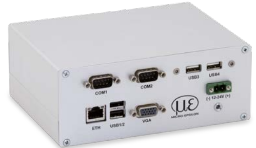
thermoIMAGER TIM NetPCQ