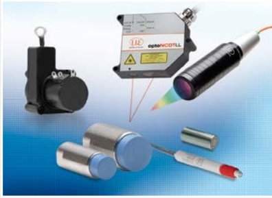
Sensors and systems for displacement and position