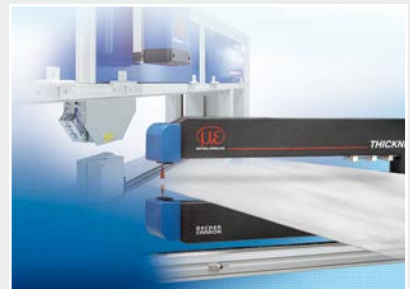
Measurement and inspection systems