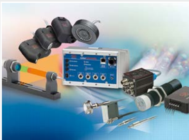
Color recognition sensors, LED analyzers and color online spectrometer