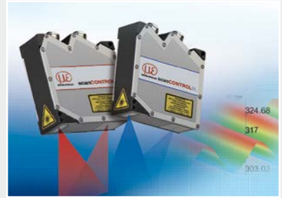
2D/3D profile sensors (laser scanner)