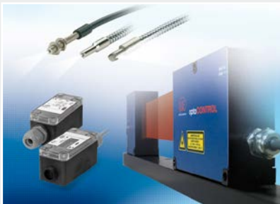
Optical micrometers, fiber optic sensors and fiber optics