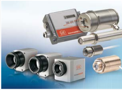
Sensors and measurement devices for non-contact temperature measurement